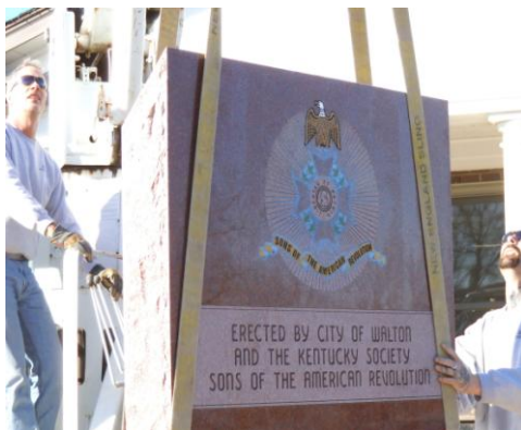
The Purple Heart monument being installed in Walton. The KYSSAR ceremony is scheduled for April 12 th .